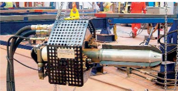
US 150 HSB

The US-HSB series are designed to bevel, face and counterbore tubes and pipes at extremely high speeds, required when time and efficiency are crucial.