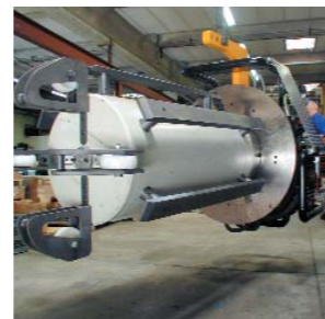
US 620 HSB shaft