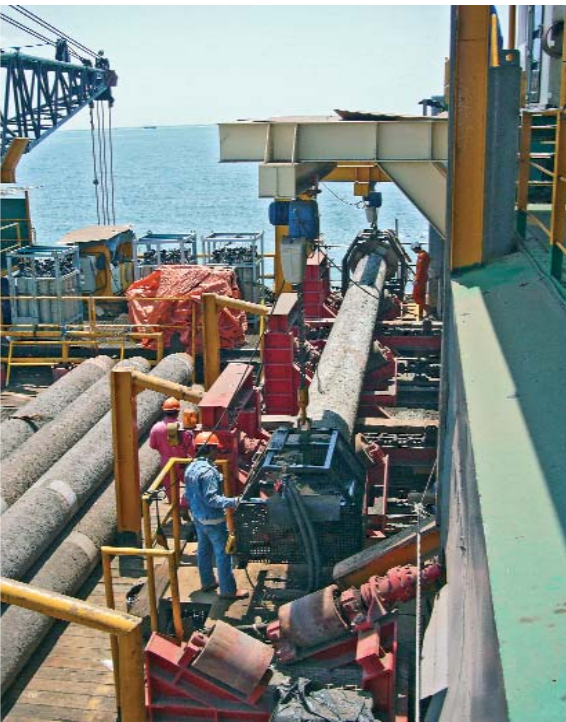
US 420 HSB