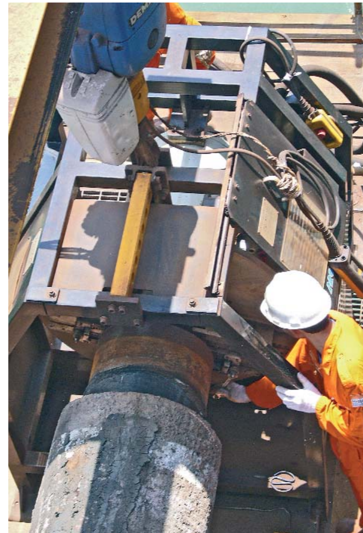
US 420 HSB 18"